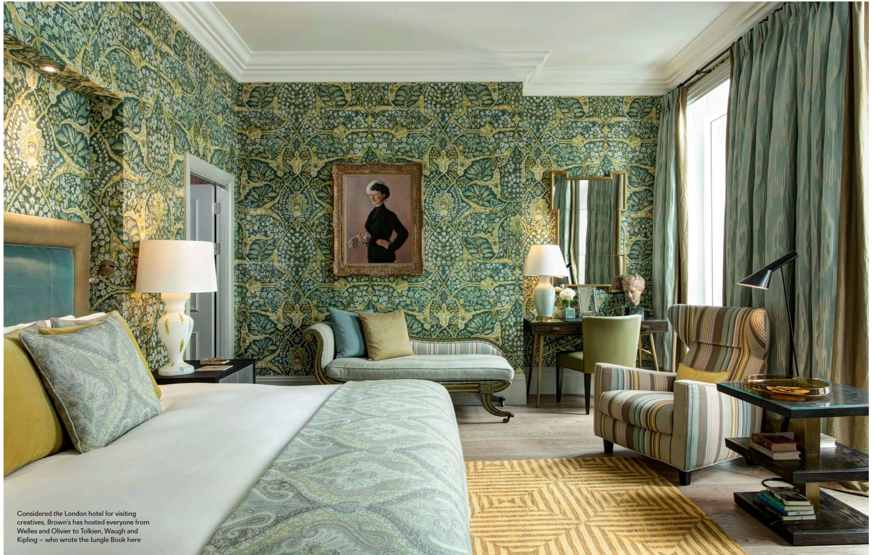
Considered the London hotel for visiting creatives, Brown's has hosted everyone from Welles and Olivier to Tolkien, Waugh and Kipling – who wrote the Jungle Book here