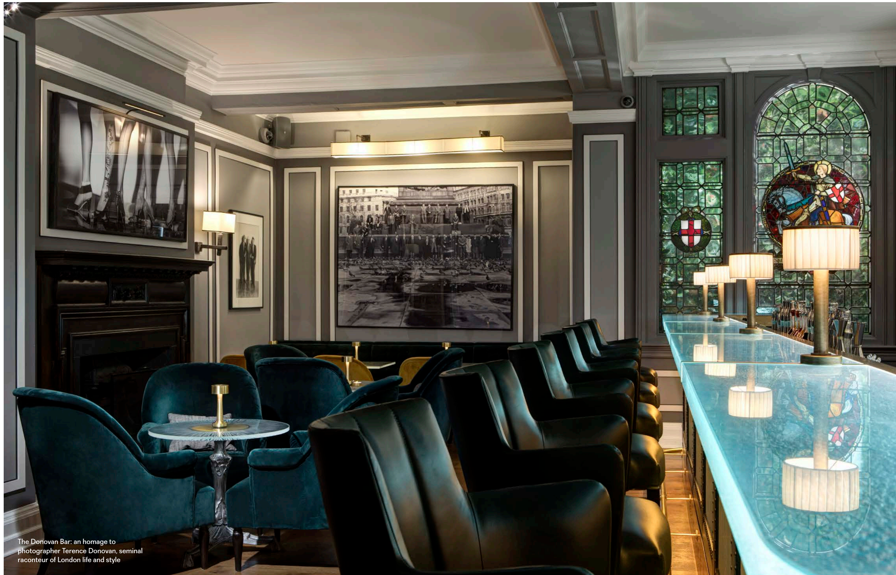
The Donovan Bar: an homage to photographer Terence Donovan, seminal raconteur of London life and style