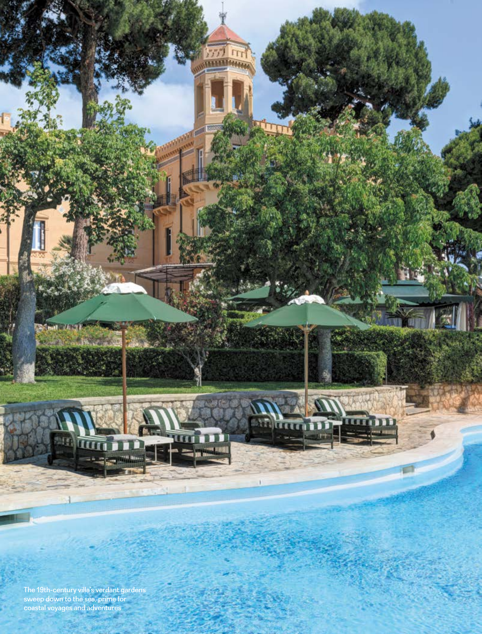
The 19th-century villa's verdant gardens sweep down to the sea, prime for coastal voyages and adventures