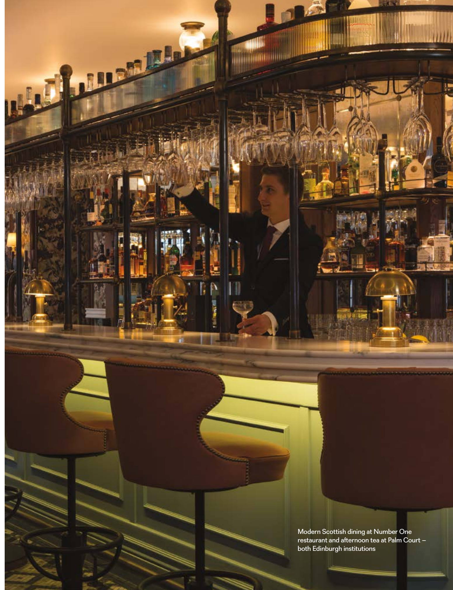
Modern Scottish dining at Number One restaurant and afternoon tea at Palm Court – both Edinburgh institutions