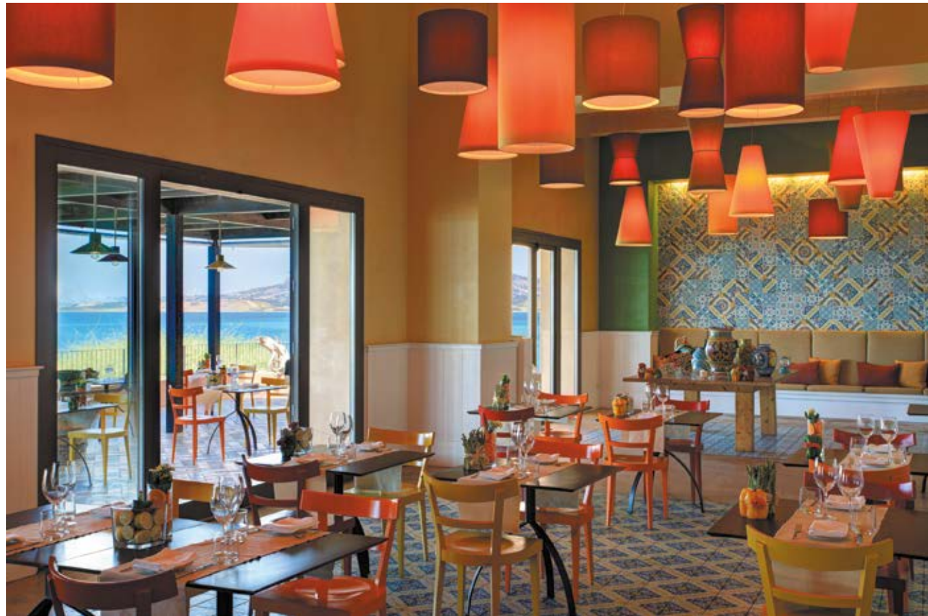
Verdura's coastline sits just west of the charming Baroque village of Sciacca; fish comes fresh from the local market, oil from Verdura's own gardens