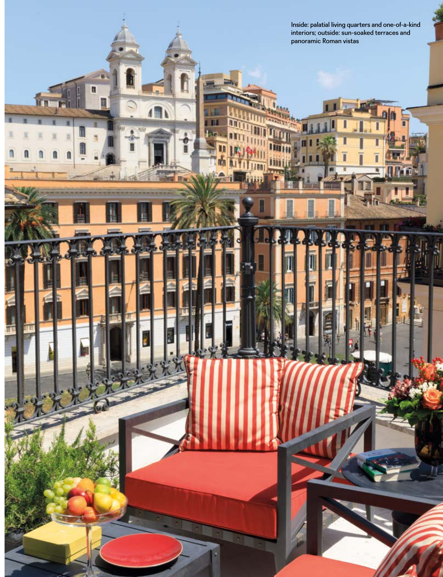
Inside: palatial living quarters and one-of-a-kind interiors; outside: sun-soaked terraces and panoramic Roman vistas