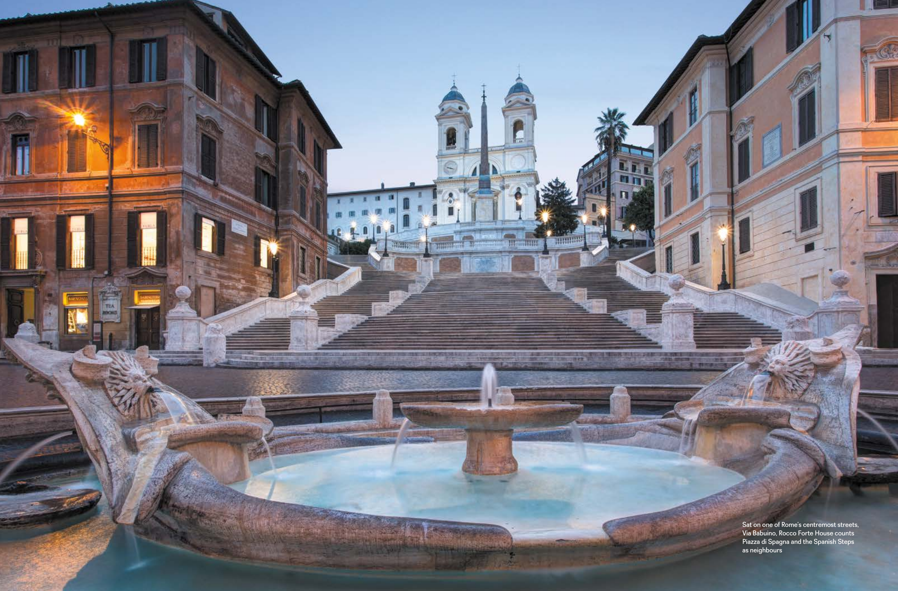
Sat on one of Rome's centremost streets, Via Babuino, Rocco Forte House counts Piazza di Spagna and the Spanish Steps as neighbours