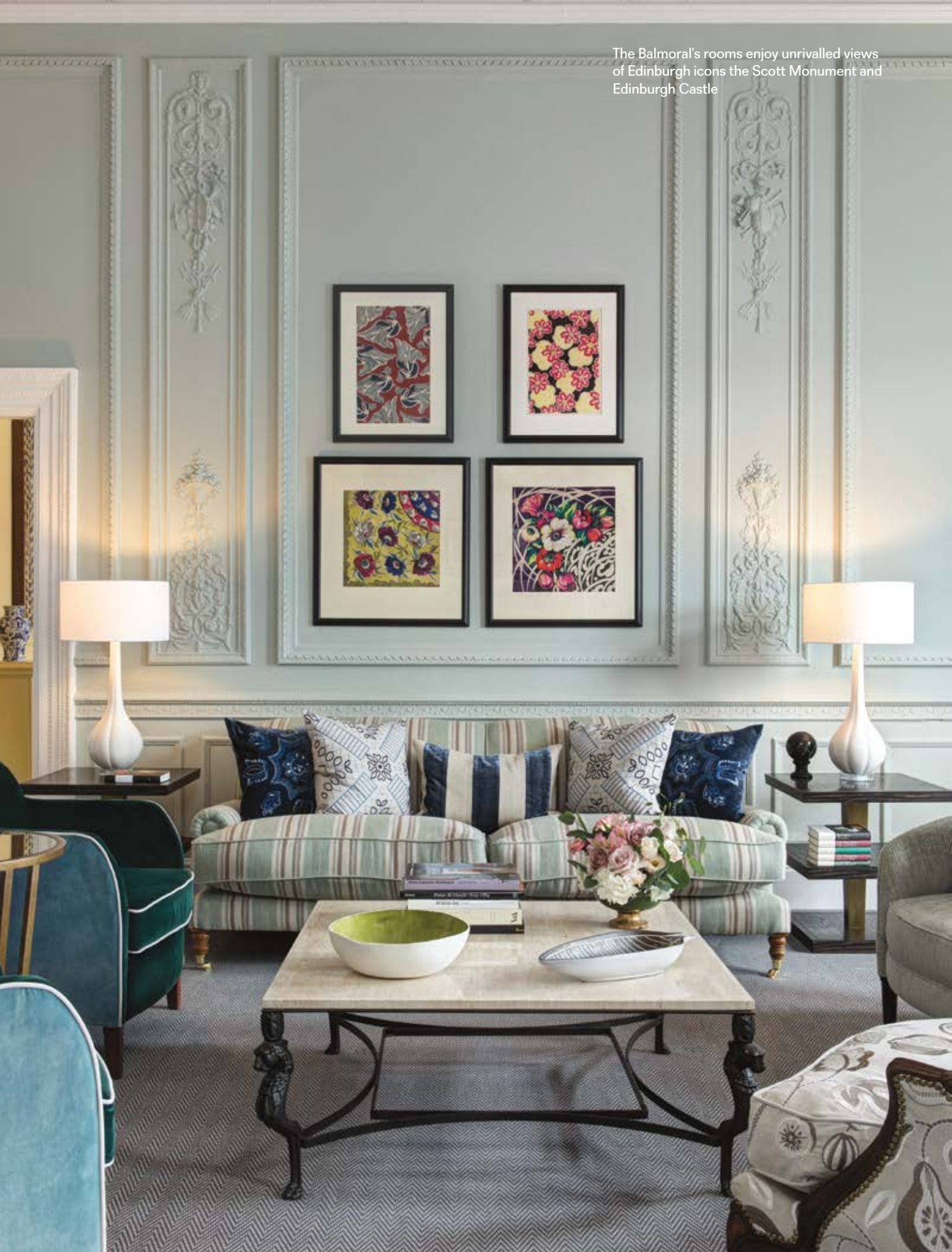
The Balmoral's rooms enjoy unrivalled views of Edinburgh icons the Scott Monument and Edinburgh Castle