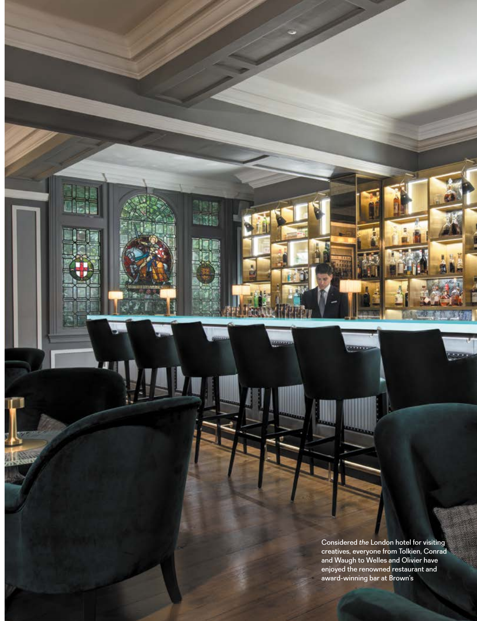
Considered the London hotel for visiting creatives, everyone from Tolkien, Conrad and Waugh to Welles and Olivier have enjoyed the renowned restaurant and award-winning bar at Brown's