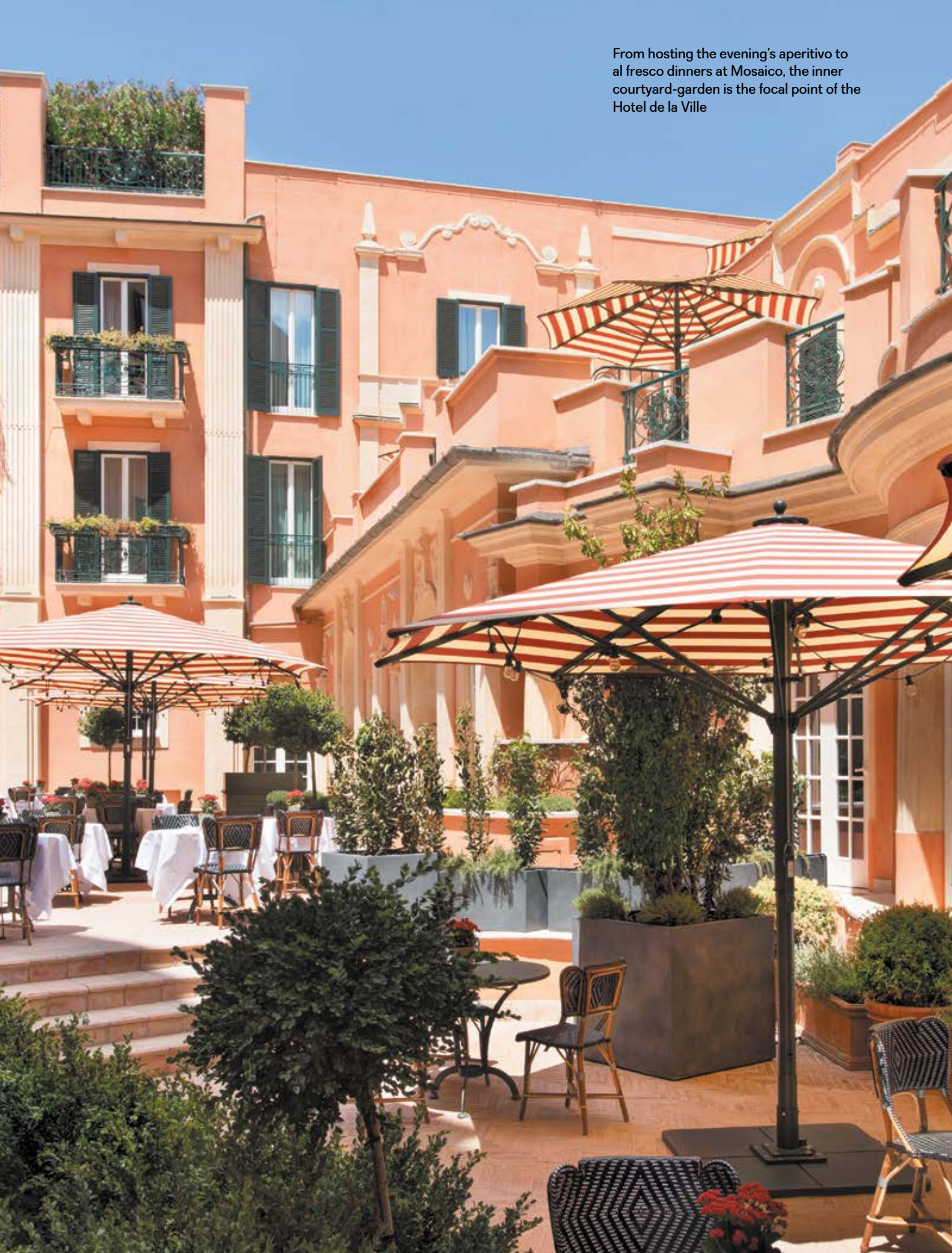
From hosting the evening's aperitivo to al fresco dinners at Mosaico, the inner courtyard-garden is the focal point of the Hotel de la Ville