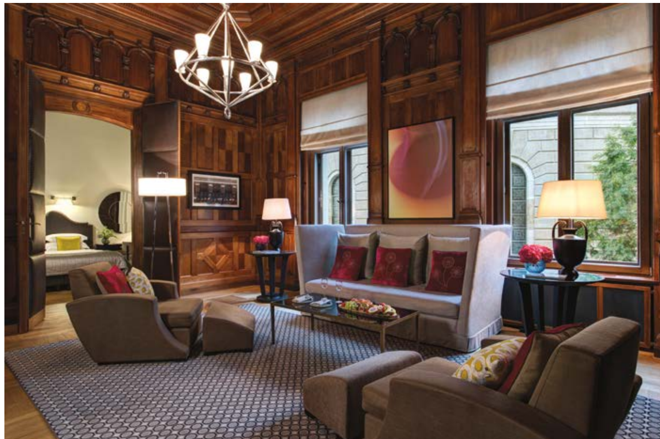
Hotel de Rome takes its name from a renowned inn that once sat on Bebelplatz, the striking square which many rooms and suites overlook