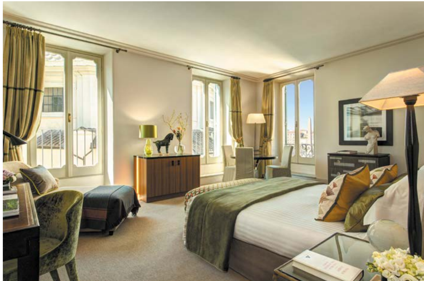
Jean Cocteau and Pablo Picasso stayed at Hotel de Russie, in adjoining rooms, while preparing to stage the first ever Cubist ballet in 1917