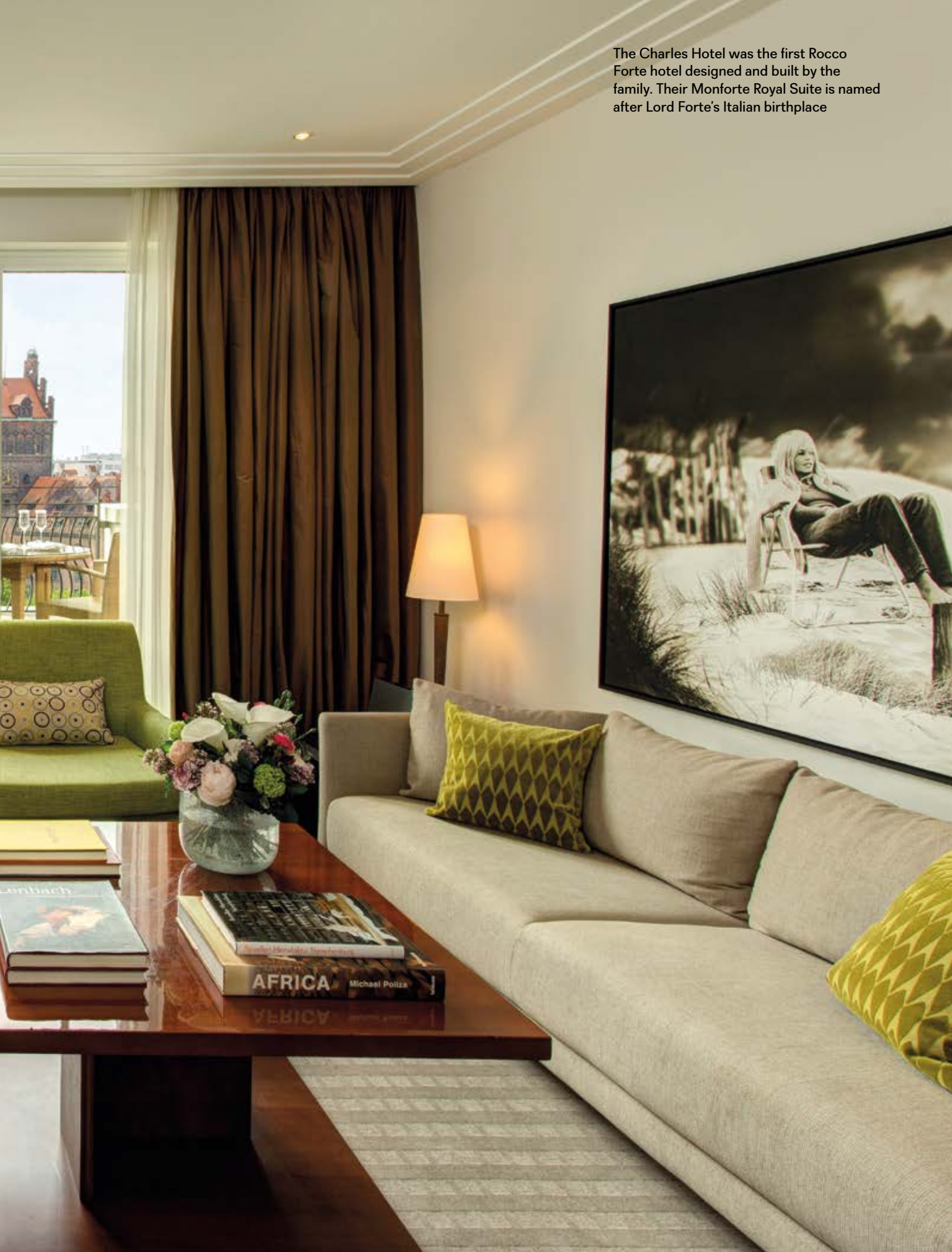
The Charles Hotel was the first Rocco Forte hotel designed and built by the family. Their Monforte Royal Suite is named after Lord Forte's Italian birthplace