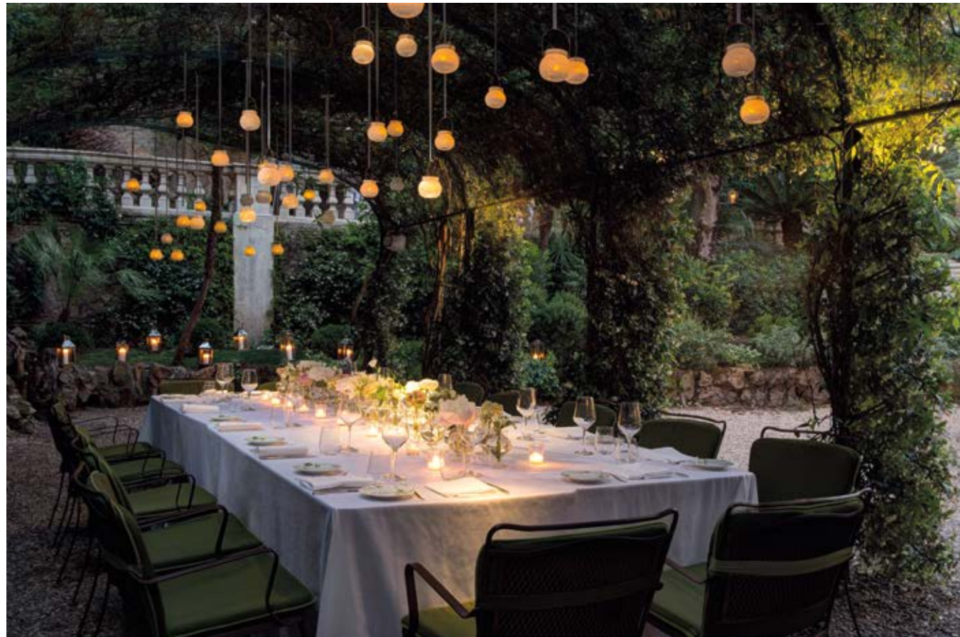
Hotel de Russie was designed in the early 1800s by architect Giuseppe Valadier, who also developed Piazza del Popolo, which the hotel overlooks