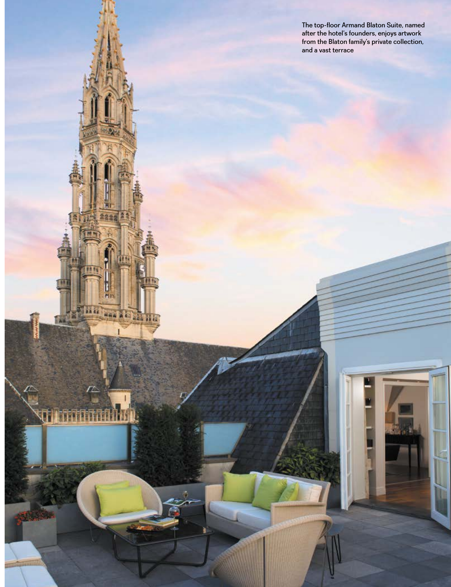
The top-floor Armand Blaton Suite, named after the hotel's founders, enjoys artwork from the Blaton family's private collection, and a vast terrace