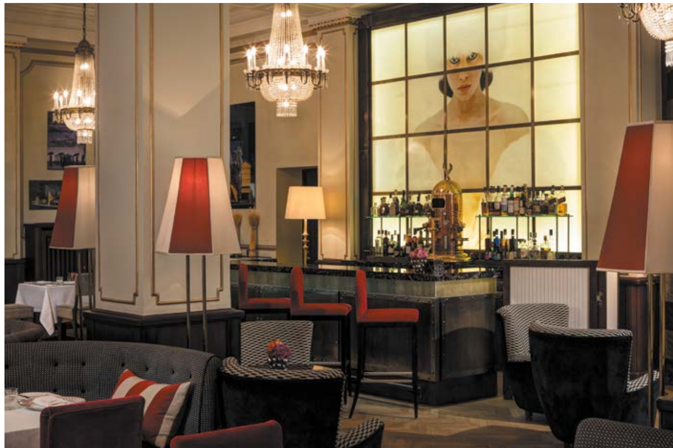
Beloved for its inventive Russian restaurant, 24-hour bar and exquisite afternoon tearoom, the Astoria has played host to everyone from Rasputin, Lenin and Bulgakov to The Doors, The Rolling Stones and Pavarotti