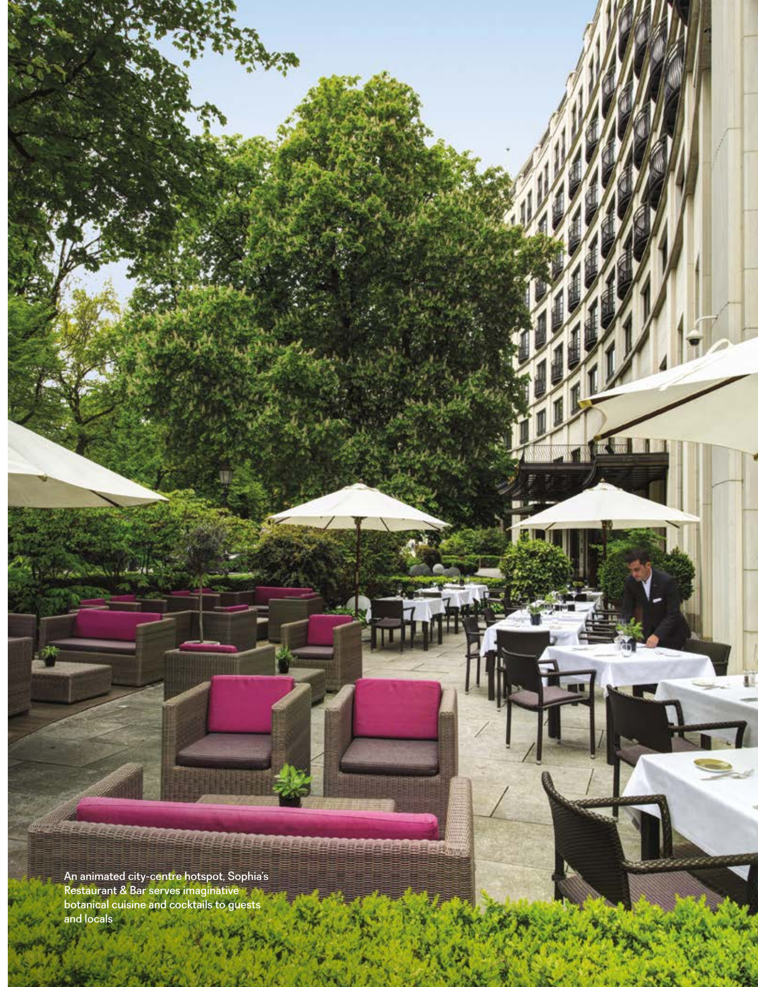
An animated city-centre hotspot, Sophia's Restaurant & Bar serves imaginative botanical cuisine and cocktails to guests and locals