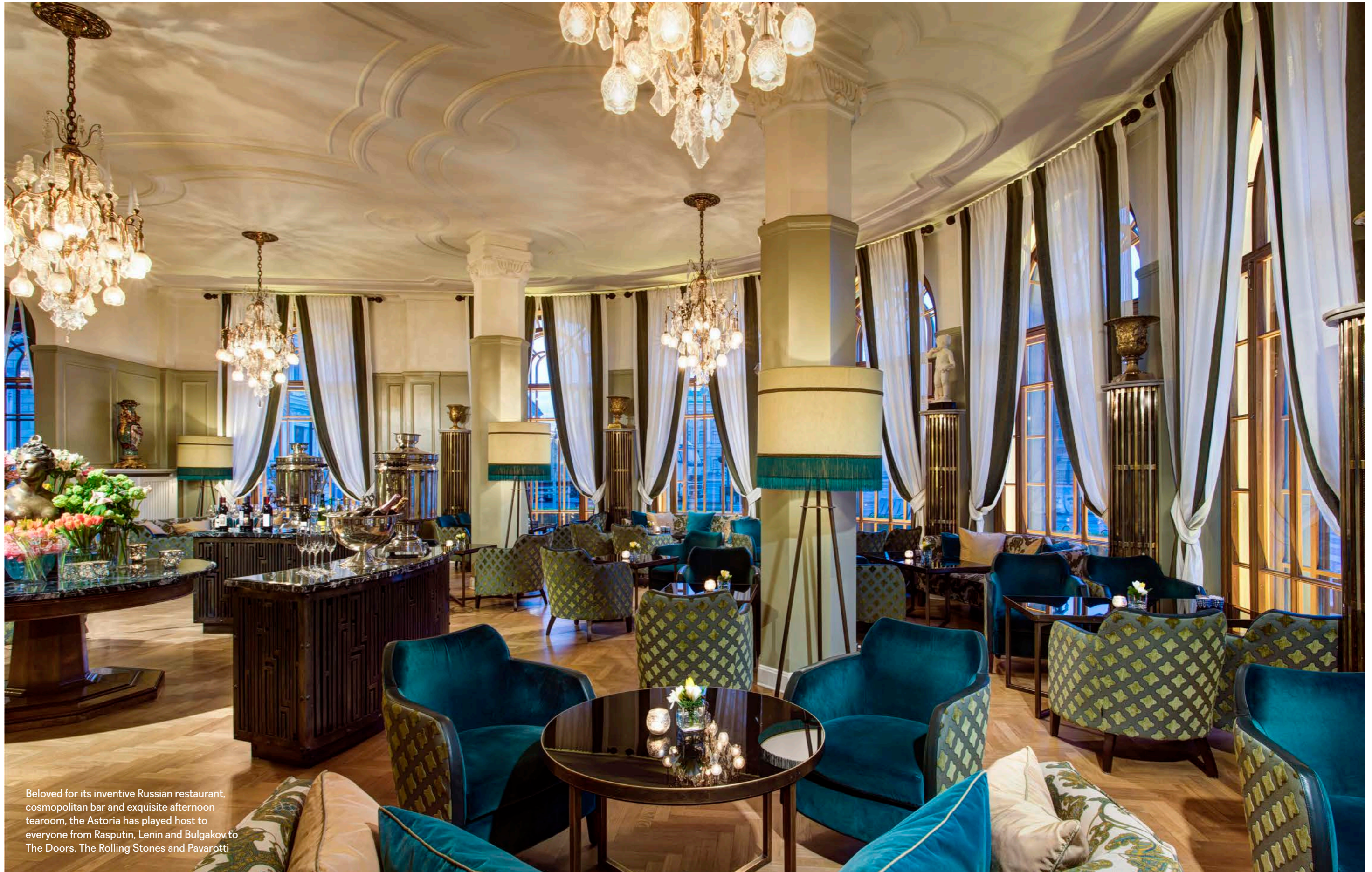
Beloved for its inventive Russian restaurant, cosmopolitan bar and exquisite afternoon tearoom, the Astoria has played host to everyone from Rasputin, Lenin and Bulgakov to The Doors, The Rolling Stones and Pavarotti