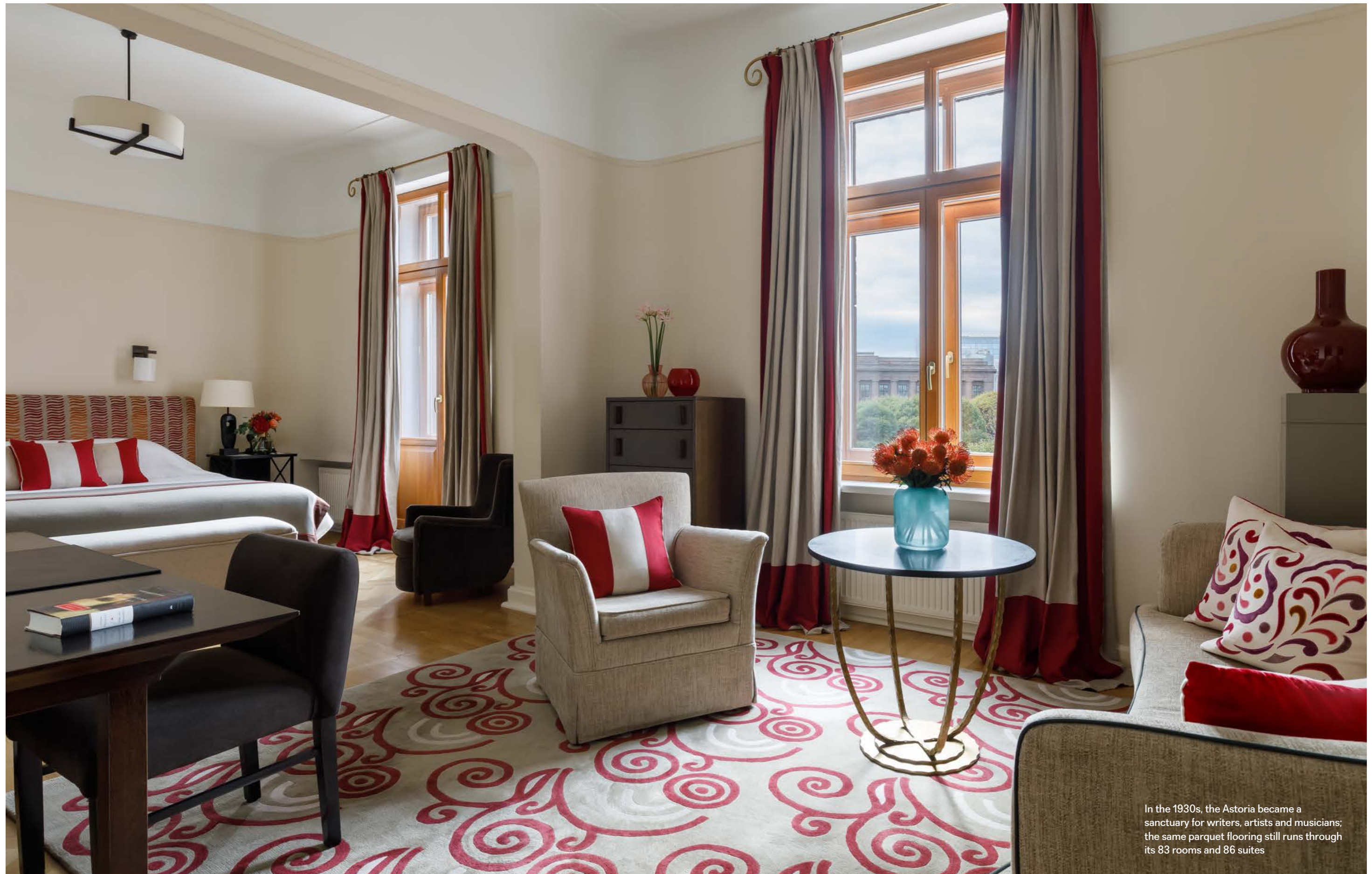
In the 1930s, the Astoria became a sanctuary for writers, artists and musicians; the same parquet flooring still runs through its 83 rooms and 86 suites