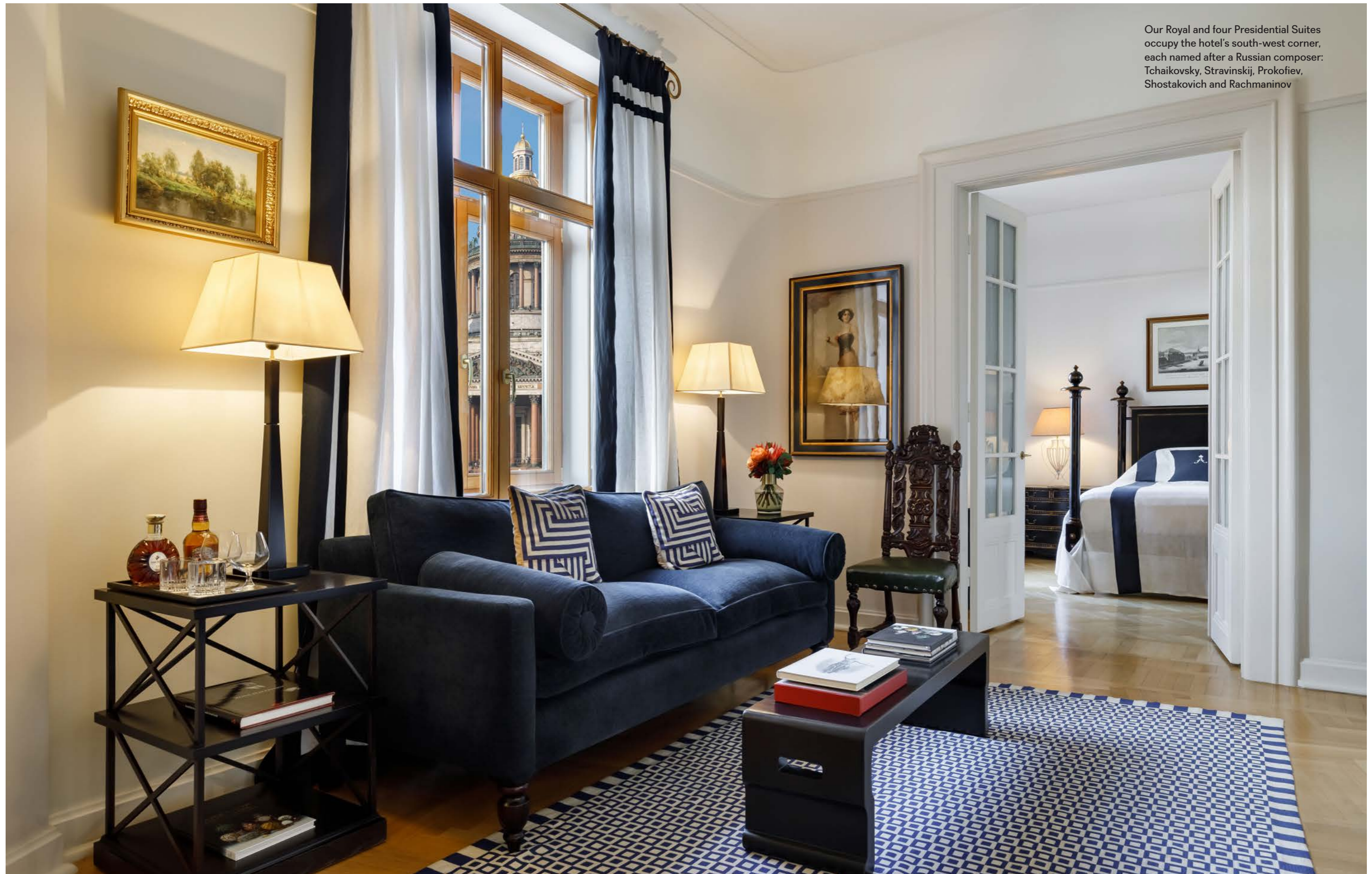
Our Royal and four Presidential Suites occupy the hotel's south-west corner, each named after a Russian composer: Tchaikovsky, Stravinskij, Prokofiev, Shostakovich and Rachmaninov