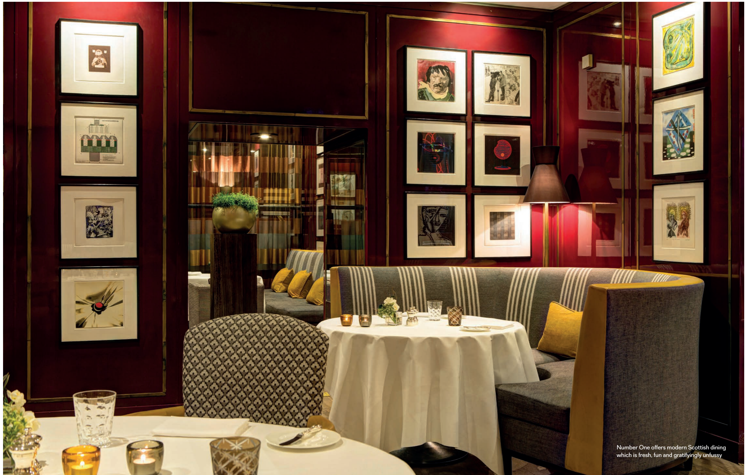
Number One offers modern Scottish dining which is fresh, fun and gratifyingly unfussy