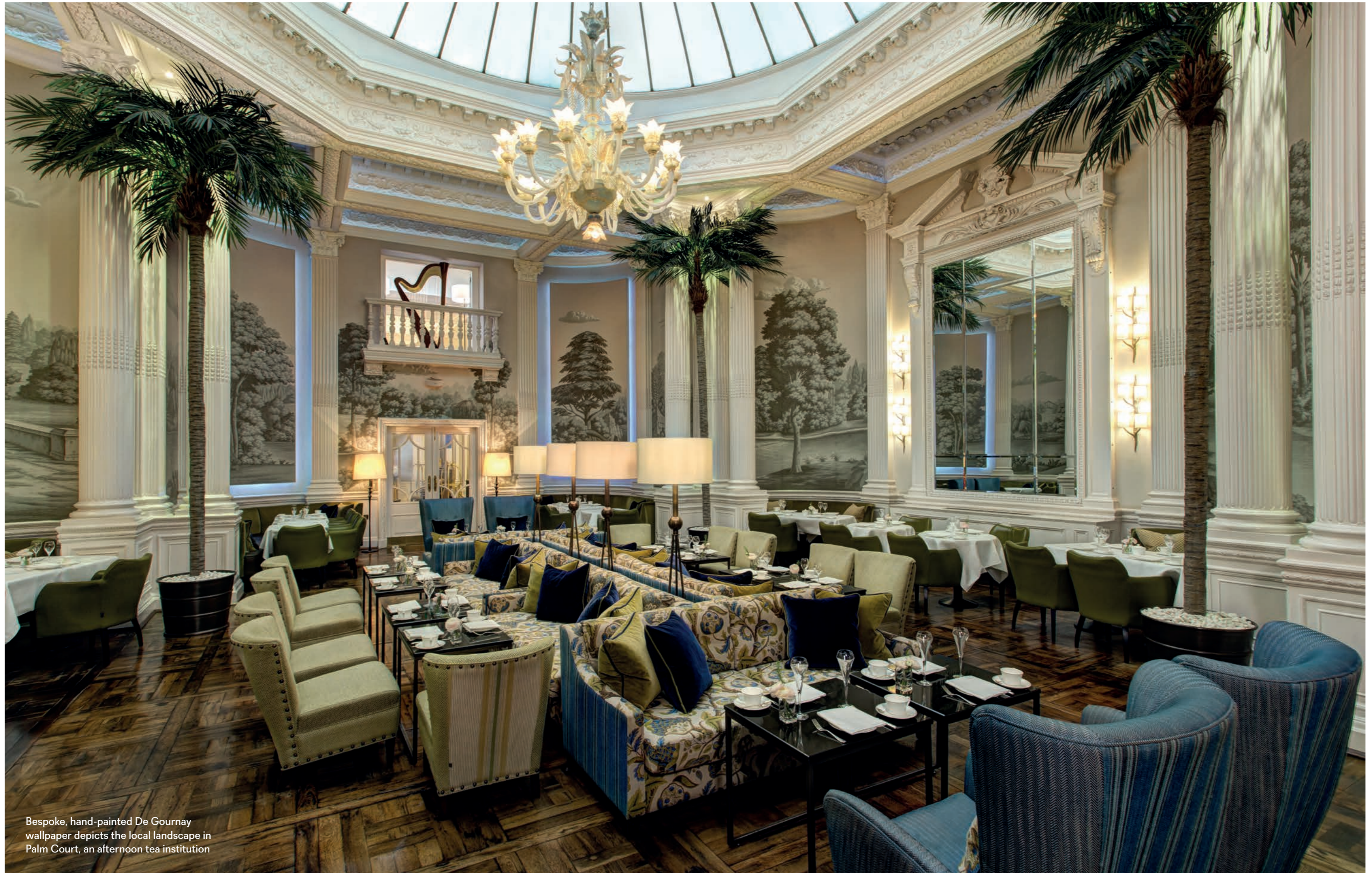
Bespoke, hand-painted De Gournay wallpaper depicts the local landscape in Palm Court, an afternoon tea institution