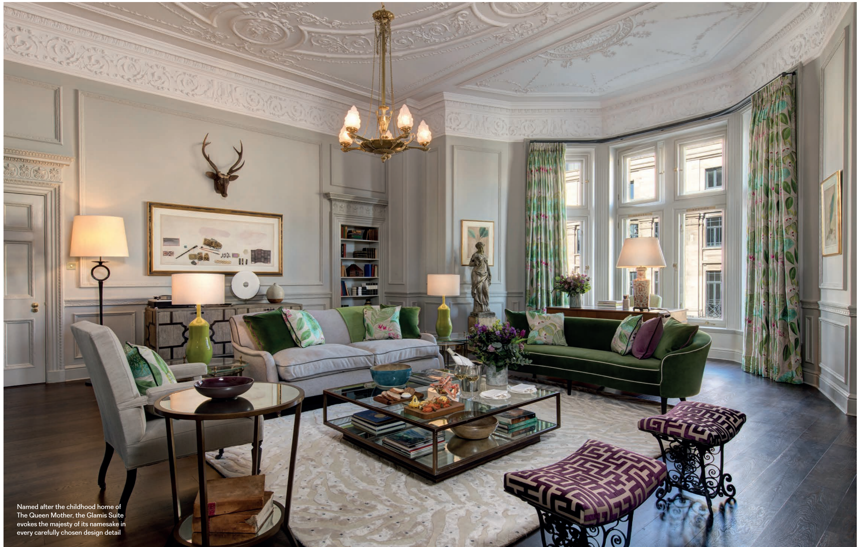
Named after the childhood home of The Queen Mother, the Glamis Suite evokes the majesty of its namesake in every carefully chosen design detail