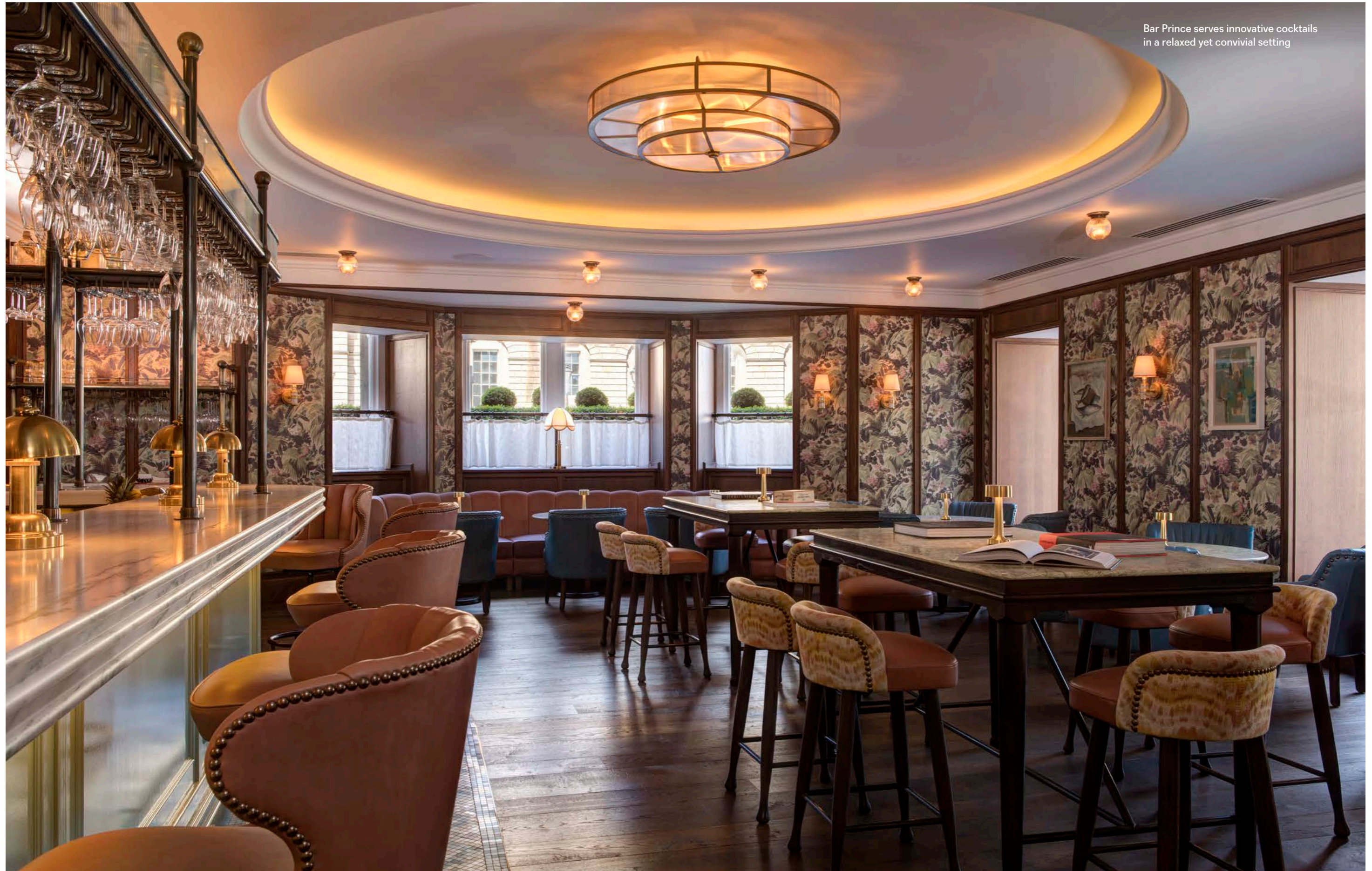
Bar Prince serves innovative cocktails in a relaxed yet convivial setting