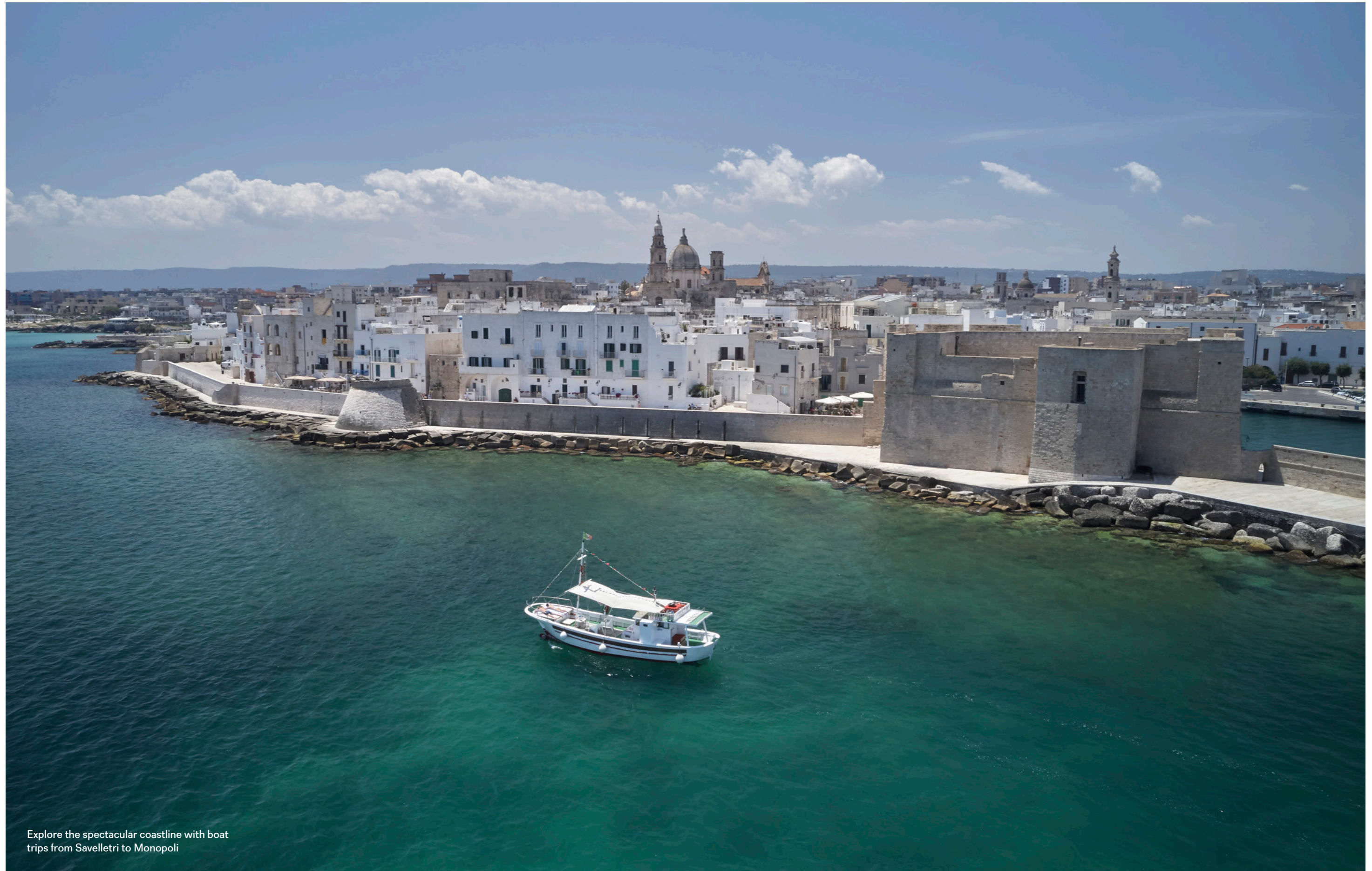
Explore the spectacular coastline with boat trips from Savelletri to Monopoli