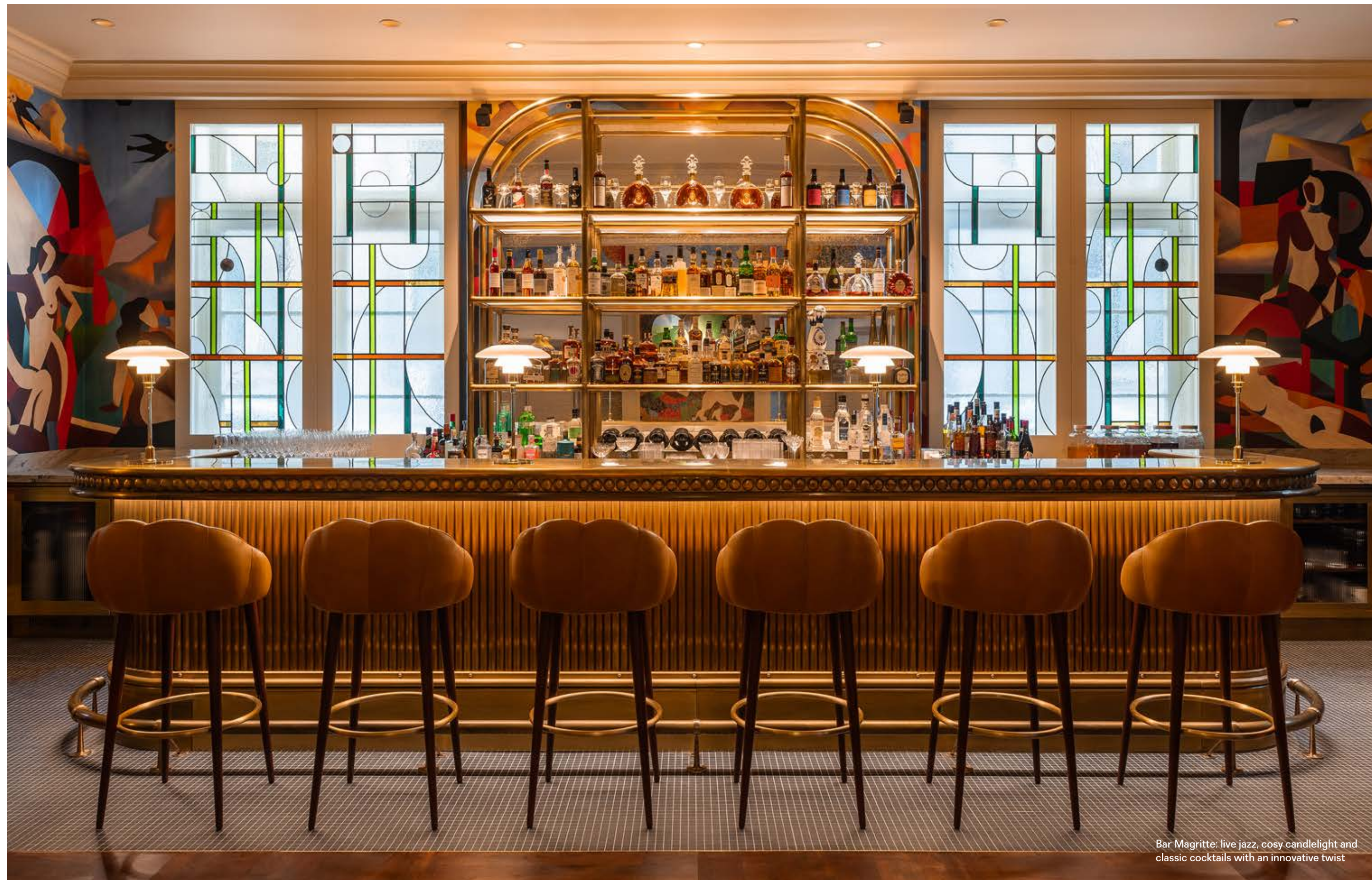
Bar Magritte: live jazz, cosy candlelight and classic cocktails with an innovative twist