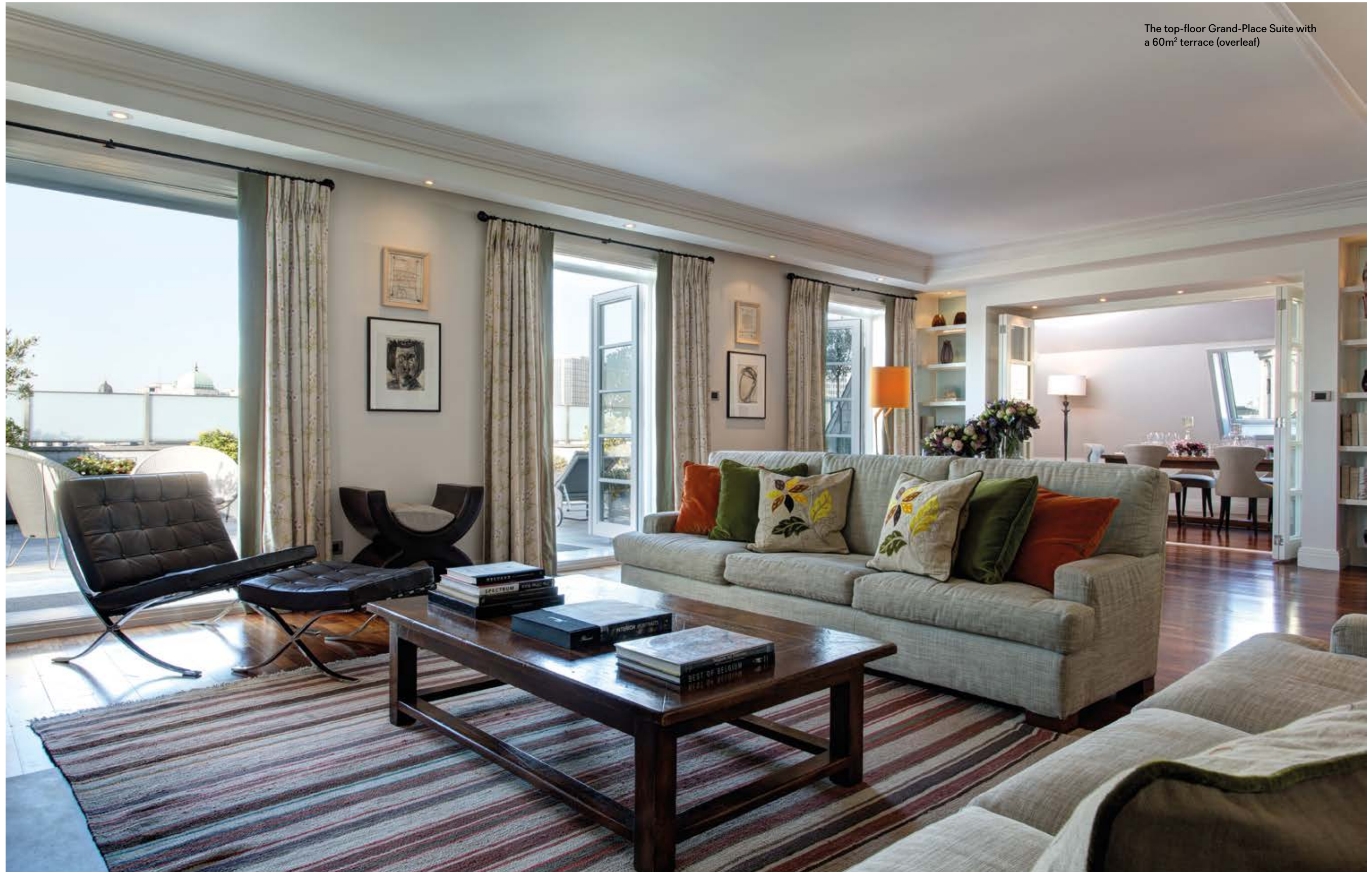
The top-floor Grand-Place Suite with a 60m 2 terrace (overleaf)