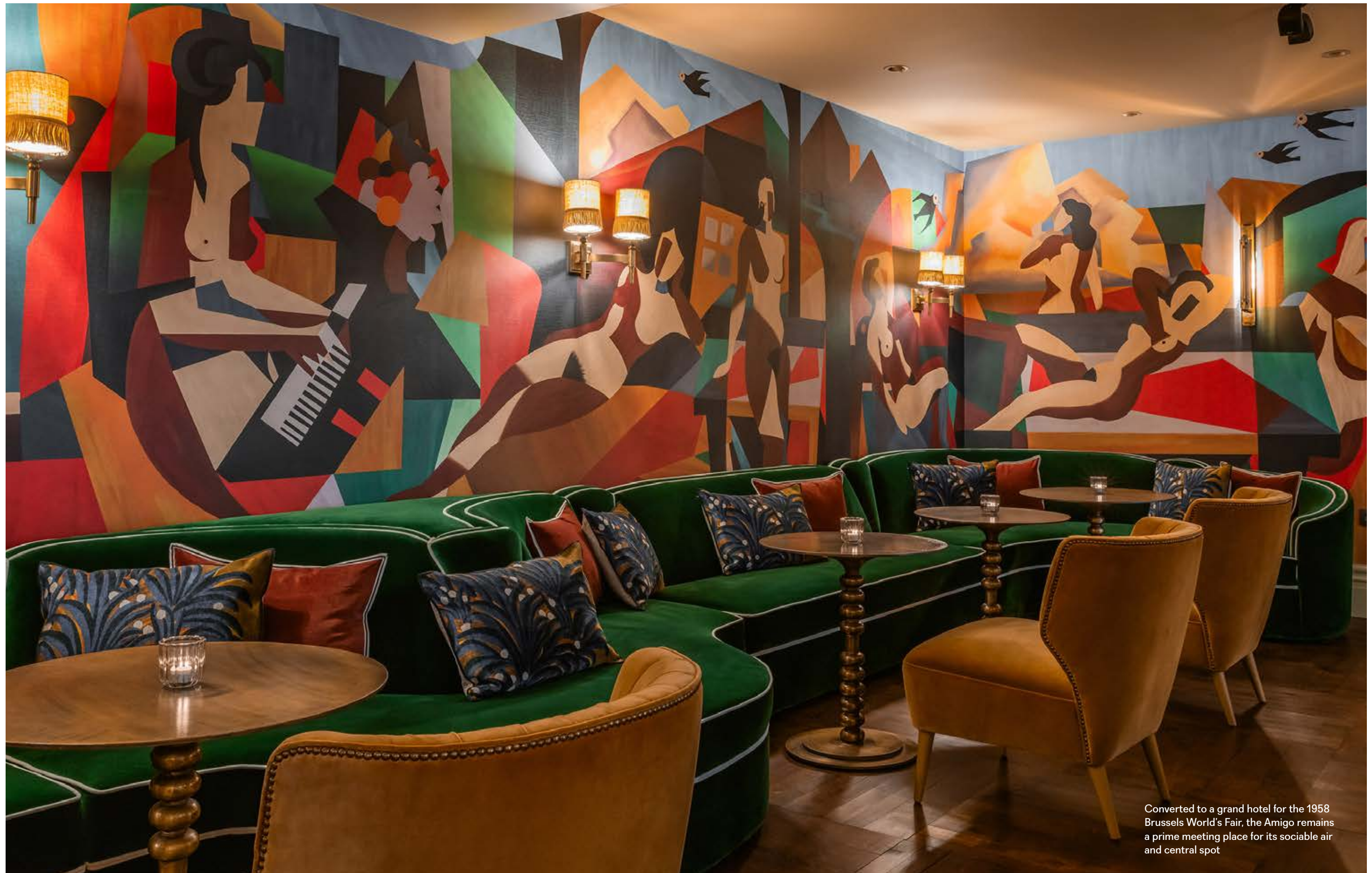
Converted to a grand hotel for the 1958 Brussels World's Fair, the Amigo remains a prime meeting place for its sociable air and central spot